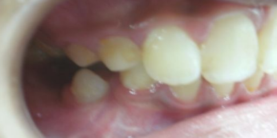
Figure-4: Post-op clinical picture after eruption of 1st premolar