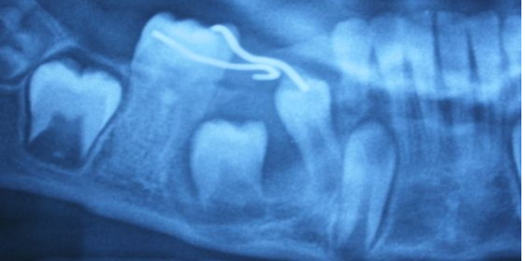
Figure-6: Splint in situ and improvement in eruption path of premolars