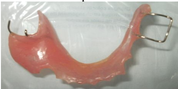
Figure-3: Splint design involving Adam's clasp and occlusal rest