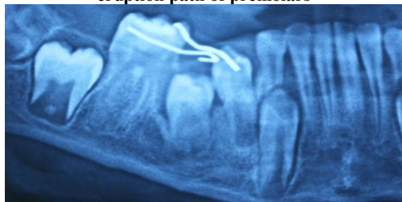
Figure-7: Splint in situ, 1<sup>st</sup> premolar visible in the oral cavity and 2<sup>nd</sup> premolar condition improved