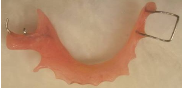
Figure-5: Splint trimmed after eruption of 1<sup>st</sup> premolar