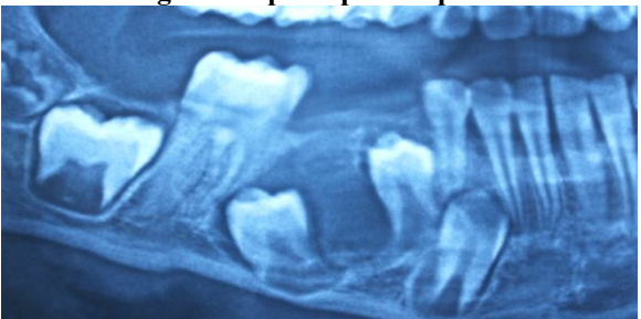
Figure-2: Deciduous molars extracted before marsupialization