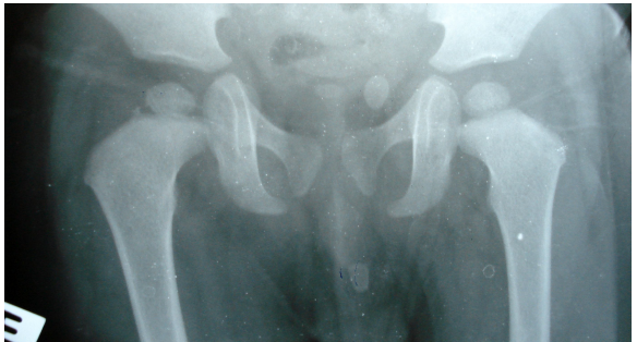
Figure-1: One stone impacted in the urethra and the other present in the urinary bladder

the left hand. Haemostasis was secured and urethra was opened longitudinally. The stone was retrieved and measured 7 mm in size (Figure-2). Another 10 Fr Foley's catheter was passed into the urinary bladder. Urethra was repaired with interrupted sutures of vicryl 5/0, followed by periurethral tissue layer which was closed in two layers with interrupted sutures using vicryl 5/0. The skin was closed. Later urinary bladder was opened and a 11 mm stone was removed. Urinary bladder was repaired along with a retropubic drain. The post operative recovery was smooth. The drain was removed after 48 hours and the Foley's catheter was removed on the sixth post operative day. The wounds healed satisfactorily and the child was followed up for 6 months and he remained asymptomatic (Figure-3).