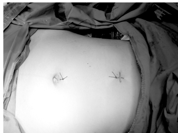
Figure-2: After operation

Two-port laparoscopic cholecystectomy has shown a higher patient's satisfaction score. 3 However, whether it offers any additional advantages remains controversial 2 . A report on two-port laparoscopic cholecystectomy has already shown that