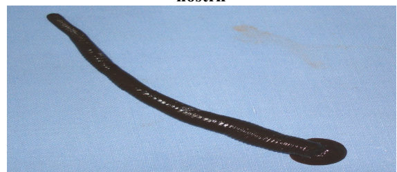
Figure-2: Leech removed with the help of forceps